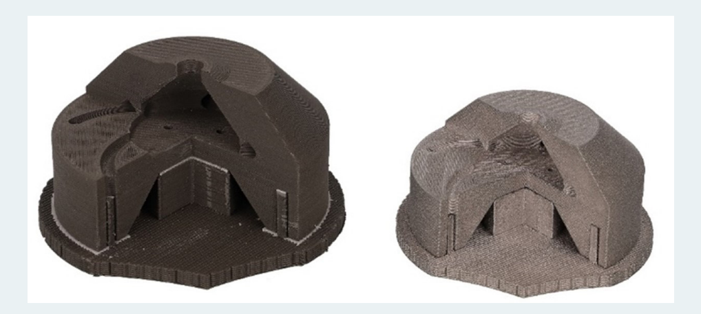
Figure 1 Green part with support structures and Ultrafuse Support Layer and sintered part with support structure