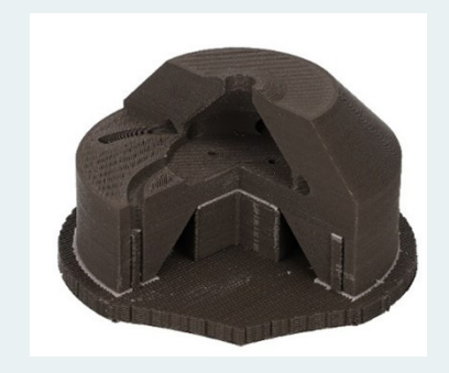
Figure 3 Green part with support structures

After debinding structural stability of the parts is at its minimum. Smart part orientation and the use of support structures in printing, reduces significantly the risk of failure in debinding and sintering. It is recommended to print the parts as flat as possible with sufficient amount of supports Please see in Picture x below an example for required supports.